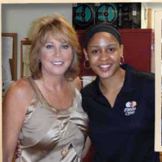
BASKETBALL HALL OF FAMER, NANCY LIEBERMAN WITH 1ST ROUND DRAFT PICK WNBA STAR, MAYA MOORE AT WNBA ALL-STAR FESTIVITIES.