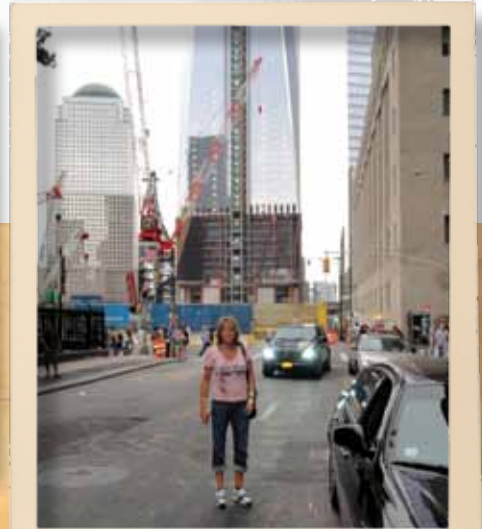
NANCY VISITING GROUND ZERO DURING HER TIME IN NYC