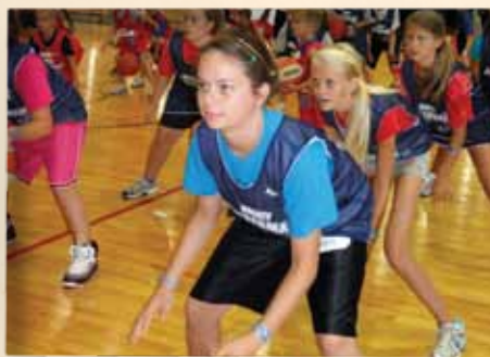
SKILLS & DRILLS AT NANCY LIEBERMAN SUMMER BASKETBALL CAMP AT THE FIELDHOUSE IN FRISCO, TX