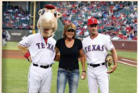
CEREMONIAL FP - NANCY LIEBERMAN