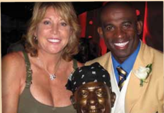
"LADY MAGIC" AND "PRIME TIME" AT DEION SANDERS ENSHRINEMENT INTO THE PRO FOOTBALL HALL OF FAME IN CANTON, OHIO ON AUGUST 6 TH