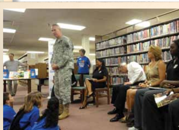
WNBA LEGEND NANCY LIEBERMAN, AND OTHER WNBA ALL-STARS AT FORT SAM HOUSTON BASE IN SUPPORT OF LITERACY AND EDUCATION DURING THE WNBA ALL-STAR WEEKEND.