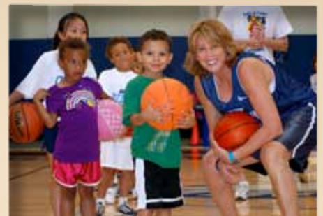
NANCY LIEBERMAN SUMMER BASKETBALL CAMP